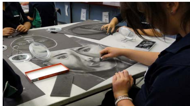
Clarkson Community High School Annual School Report 2011 In Brief