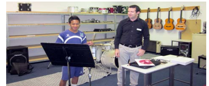
Everyone to Care