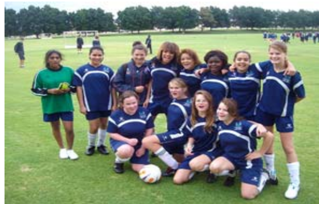
Clarkson Community High School Annual School Report 2011 In Brief

At Clarkson, we work toward building strong interpersonal relationships between students and teachers, founded on trust, respect and responsibility.